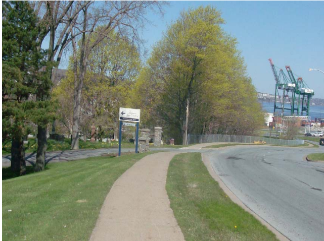
Figure 5-2: Windsor Street