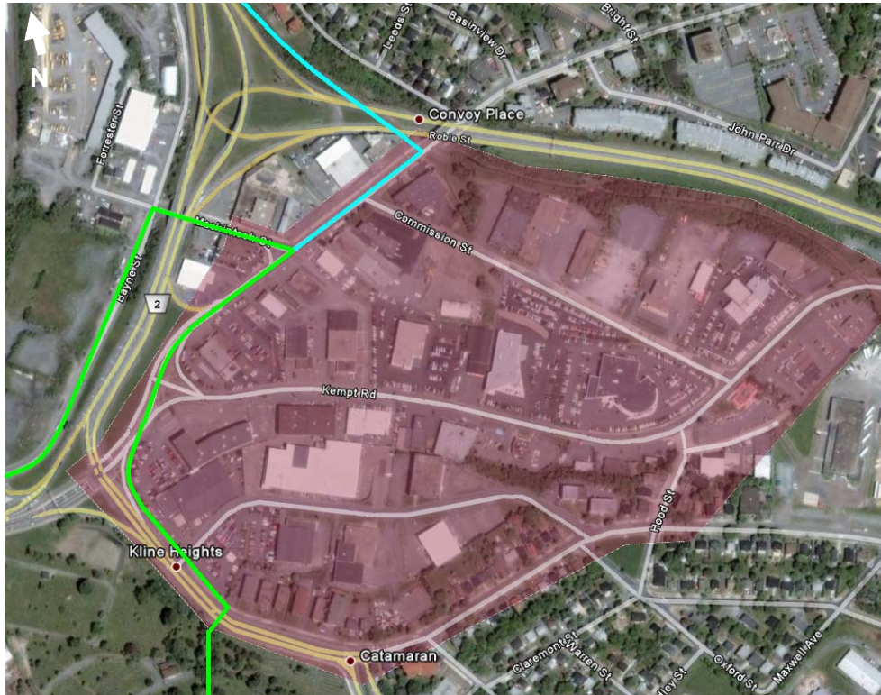
Figure 5-4: Windsor Exchange / Kempt Road Area