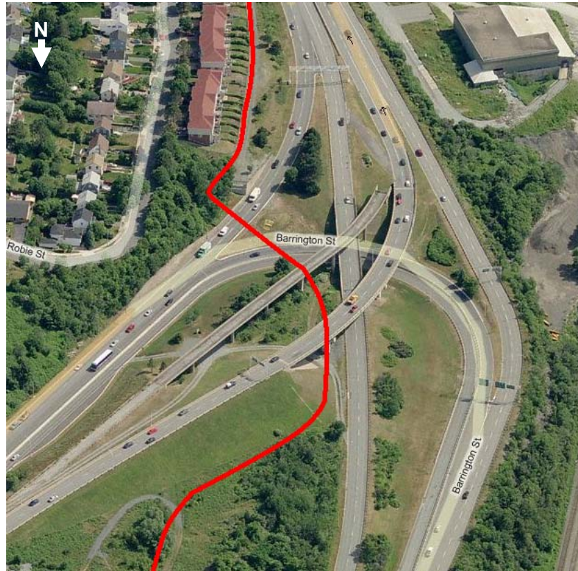
Figure 5-6: Memorial Drive Active Transportation Connection