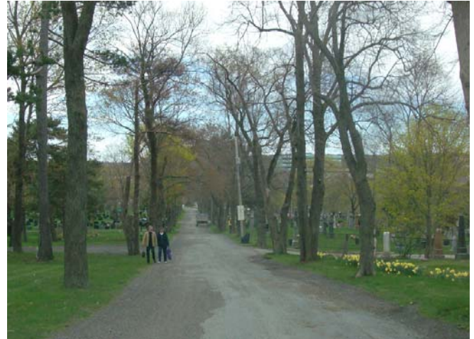
Figure 5-3: Fairview Cemetery